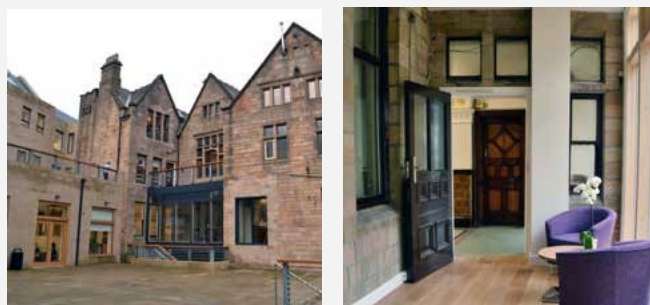
Figure 3-4. Hebden Bridge showing the old Town Hall and the new extension on the left. A recessed seating area in the walkway linking the old Hebden Bridge Town Hall and the new extension on the right.

The Access Audit Handbook includes six case studies. The first five case studies are extracts from completed access audit reports, each relating to a very different type of development – a theatre, the penguin enclosure at London Zoo, a parish church, an external environment and a university science laboratory located in an historic building.